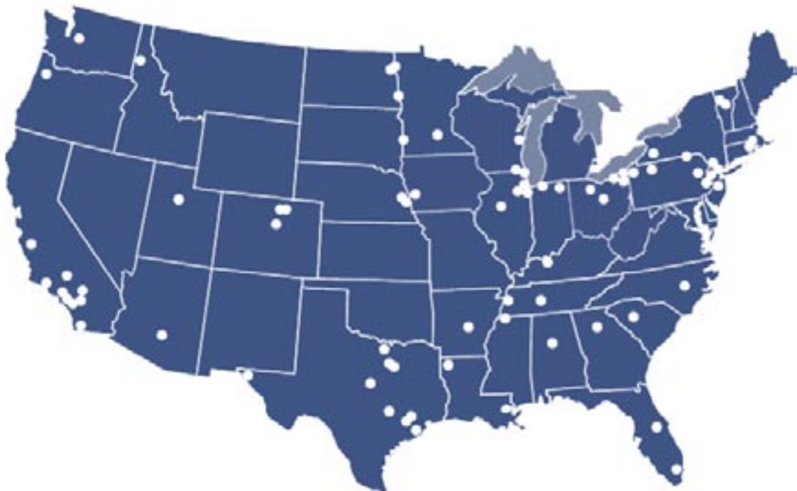
Figure 4. Companies all across the country were engaged in making parts for wind turbines in 2004. 77 With the recent boom in wind energy, the number of such companies is certainly greater today.

Just as the vast wind energy resources on the Great Plains or the solar energy resources in America's South-