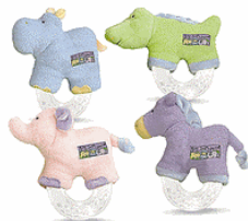
Baby Gund Jungle Collection Teether: Testing Found One Phthalate