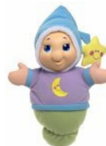
Hasbro's Gloworm: Testing Found Three Phthalates