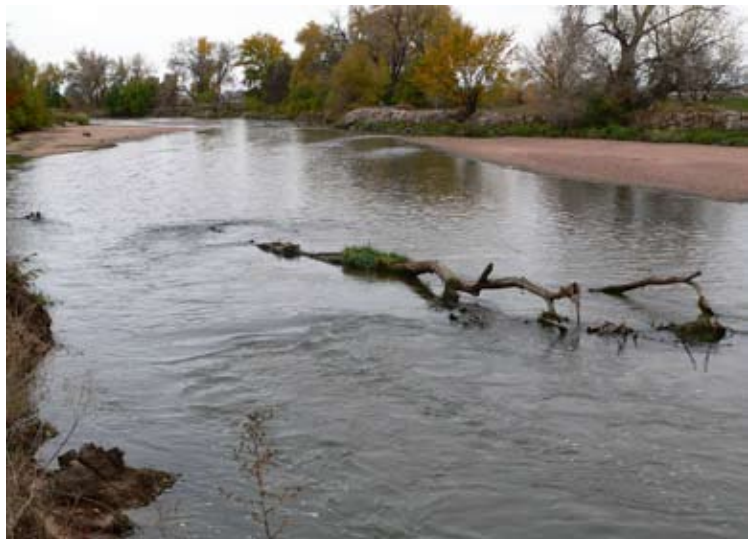
South Platte River

Approximately one-third of the basin is publicly-owned, largely in the mountains, and waters within these areas are classified as Outstanding Waters (including waters within Comanche Peak, Indian Peaks, Lost Creek, Mount Evans and Rocky Mountain National Park). 119 The Denver metropolitan area sits in the center of the South Platte sub-basin. 120 The Eastern Plains is an area of intensive agricultural use and has extensive canal and reservoir systems in place. 121