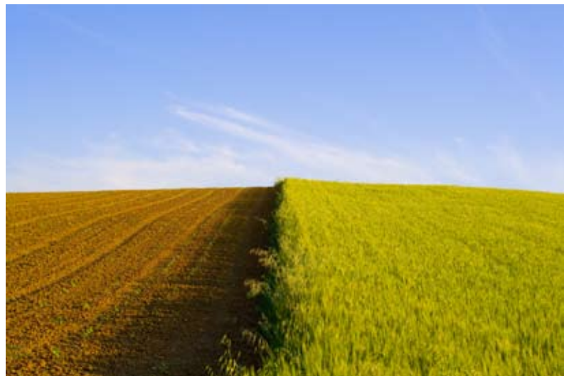
Buffer zones of vegetation between agricultural fields and rivers can be effective BMPs

In Minnesota, there are many partners in the CWSRF/agricultural loan program. 305 Counties receive the loans from the CWSRF and manage agricultural loan programs at a local level. 306 Soil and water conservation districts assist farmers