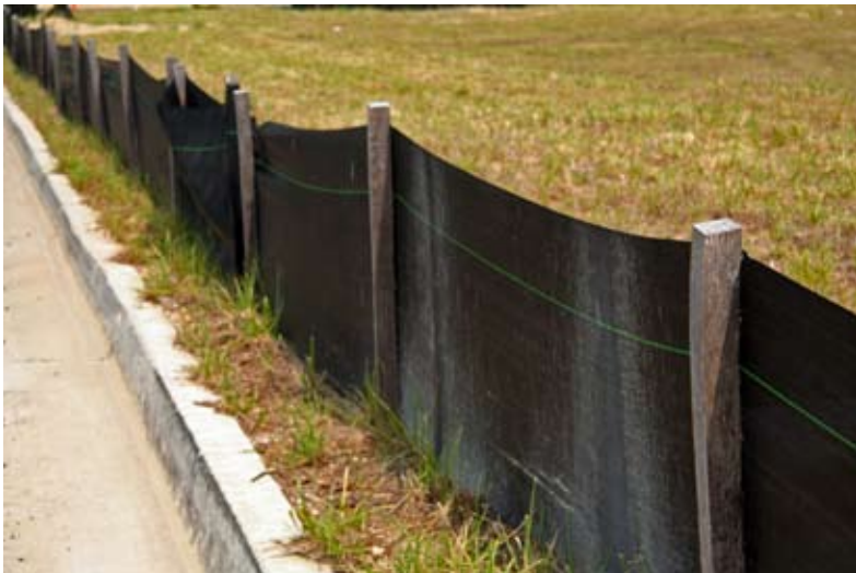
Silt fencing, a common BMP for construction sites

Additionally, Maryland just passed stormwater management legislation that requires smarter, cleaner development practices in order to protect its waters. The Maryland Stormwater Management Act focuses on pollution prevention, since it is cheaper and simpler to prevent stormwater pollution from entering waterways than to clean it up later. 280 The Act requires developers to use environmental site design to ensure that there is no net increase in runoff from development sites and directs cities and counties to update local zoning codes to allow for low impact design techniques. 281 It also requires the Maryland Department of the Environment to propose a fee schedule to fund increased enforcement of stormwater laws and to create a process for permitting development in a way that better protects waters. 282