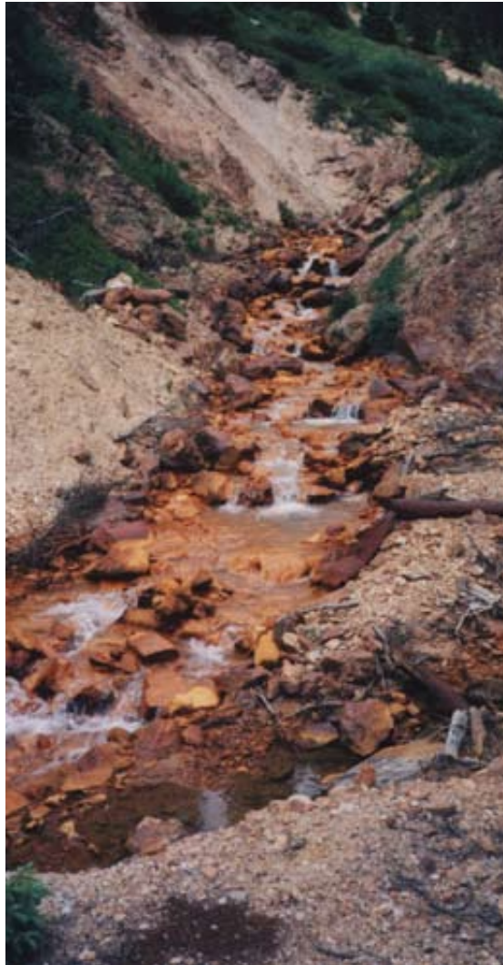
Upper Animas River, acid mine drainage

Colorado currently has over 23,000 abandoned mines, generally within the mineral belt, which extends from Boulder south and southwest to Silverton. 249 A 1998 study showed that more than 1,300 miles of streams in Colorado are affected by heavy metal contamination. 250 Of the 211 stream segments currently either listed as impaired or placed on the monitoring and evaluation list,