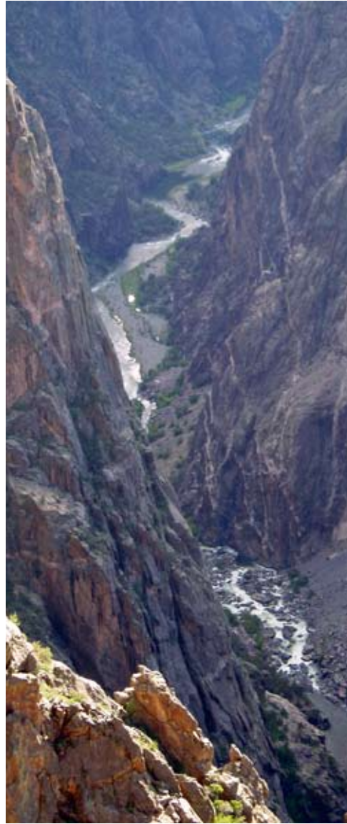
Colorado River

these assessments, 68% of river miles and 67% of lake acres in the Basin fully support all of their designated uses. 87 5% of river miles and 11% of lake acres were placed in the insufficient data category. 88