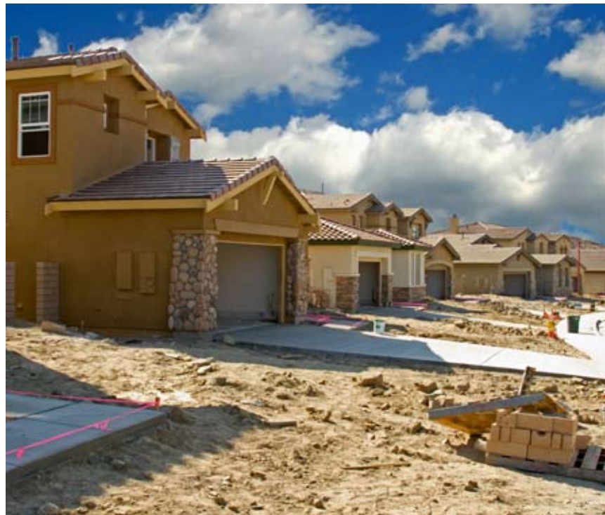
Residential construction

Another challenge that accompanies increased development is increased use of septic systems,