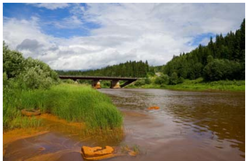
River polluted by mining runoff

A Good Samaritan law that is narrowly drafted so that it protects true Good Samaritans from ongoing liability under the CWA for discharges directly related to remediation activities is needed. Such a law would enable groups like the Animas River Stakeholders Group (ARSG) to clean up highly contaminated watersheds like the Upper Animas River, which is impaired by tailings from abandoned gold, silver, lead and zinc mines from the historic Eureka mining district. 317