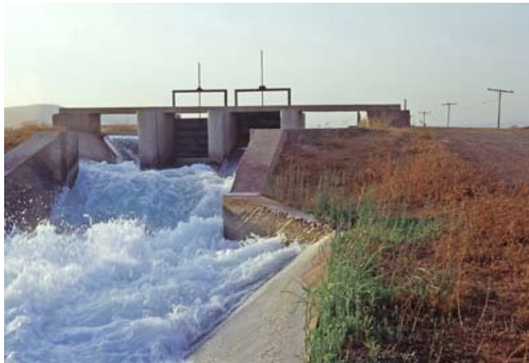
Water diversion structure

Times have changed. In the past, water was used mainly for extractive purposes, such as farming, mining, and industry. Very little value was placed on protecting water quality. Today, however, our