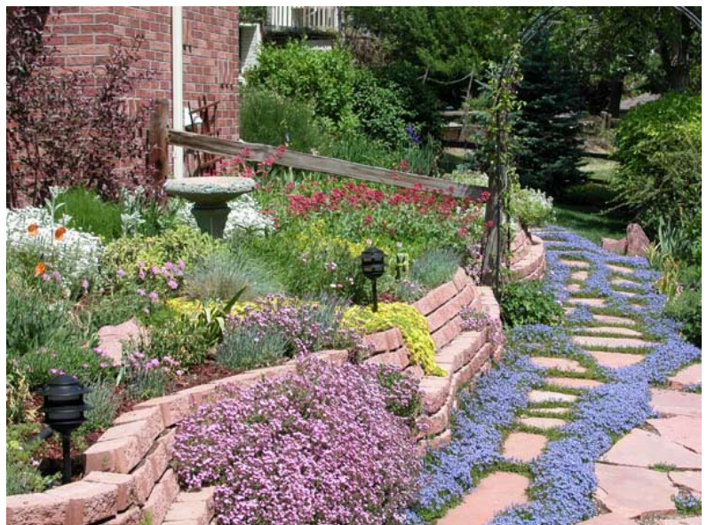
Xeriscaped yard - Photo courtesy of www.xeriscape.org

A “salvage” bill would change water law to allow an irrigator who increases his efficiency to benefit from that action by retaining the ability to sell or lease that water to another water user. This would give irrigators a big incentive to implement efficiency measures because they could make money from the water they save. It would also free up potentially huge amounts of water that could be used elsewhere in the system, whether by cities or to protect our ecosystems and water quality. The