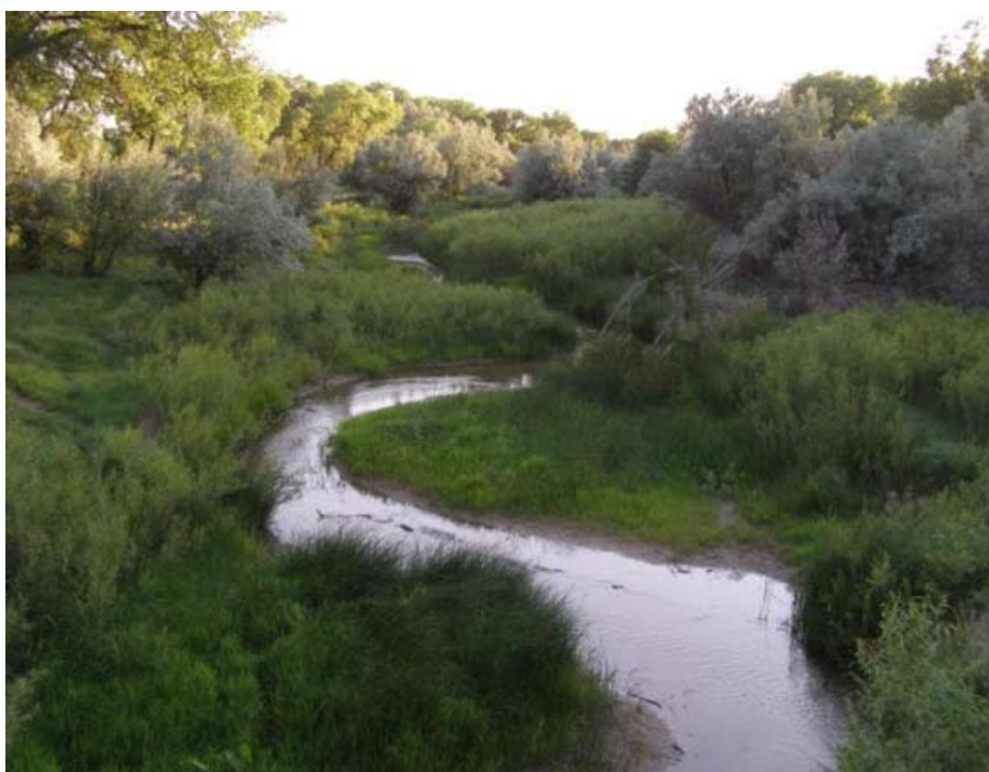
Republican River

One example of the potential pollution from hog farms is found east of Greeley, 148 where a huge hog farm which closed its doors in 2000 has left behind an abandoned mess that will cost over $1 million to clean up. 149 The farm sprawled over 23,000 acres and produced as many as 150,000 hogs. 150 It also created a “river of swine waste gunned from industrial sprinklers.” 151 After state health officials banned land application of waste in the winter to prevent pollution, the company was cited for violating this rule 250 times in 1999 and 2000. 152 Though the farm has been closed for six years, pollution still remains from the farm’s activities: groundwater in monitoring wells shows levels of nitrates 10-12 times higher than the health standard. 153