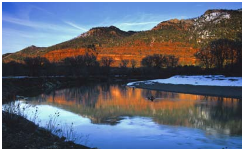
Animas River near Durango

The Dolores River picks up approximately 205,000 tons of salt annually, primarily from natural sources, as it crosses the Paradox Valley. 80 The