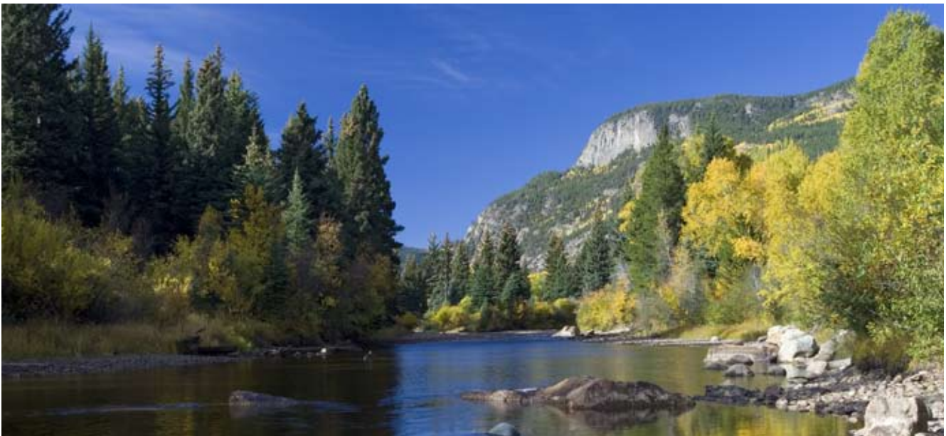
Cache la Poudre River - © Sebastien Windal, under license from Shutterstock.com

The data yielded by this process is neither complete nor up to date. Due to the sampling schedule, the data is relatively recent for only one of the basins. For one basin in each 305(b) Report, the data is four to five years old, for one it is three to four years old, and for one it is two to three years old. Additionally, even during the year in which a basin is intensively sampled, the entire basin is not assessed. 16