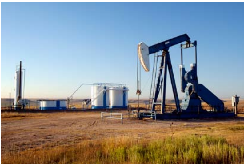
Drilling rig - © Jim Parkin, under license from Shutterstock.com

and erosion control measures are required for construction activities on oil and gas sites in Colorado, as on all other sites. However, problems with compliance and a lack of inspection and enforcement personnel are also the same, as described elsewhere in this report.