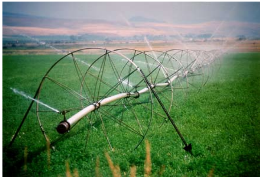
Irrigation of agricultural fields

Because agricultural runoff and return flows are exempt from CWA permit requirements, they are managed through relatively simple "best management practices" (BMPs). The cost to implement BMPs for irrigation, however, is estimated at $25 million per year, plus an additional $15 million per year for nutrient management BMPs and $5 million per year for pest