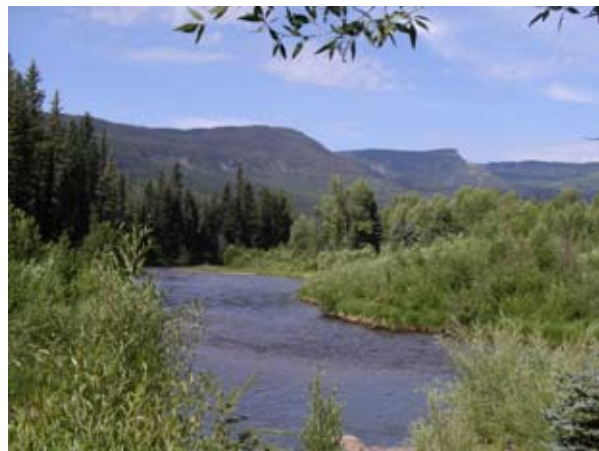
Conejos River - Picture courtesy of gartholson.net

The major water quality concern in the basin is the effect of historic mining activities throughout the headwaters region and the San Juan and Sangre de Cristo mountains. 62 In fact, there are two historic mining sites so polluted that they have been designated as Superfund sites: the Summitville Mine and the Bonanza Mining District. 63 The other water quality concern in the basin is agricultural runoff in the San Luis Valley. 64