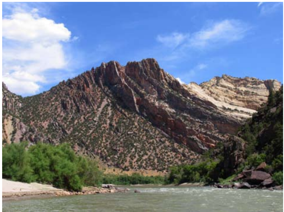
Green River

Intense interest is focused on the Piceance Basin because it is thought to contain 1 trillion barrels of