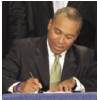
Gov. Deval Patrick signed the Green Communities Act on July 2, 2008, which will increase our use of clean energy and bring new green jobs to the Commonwealth.