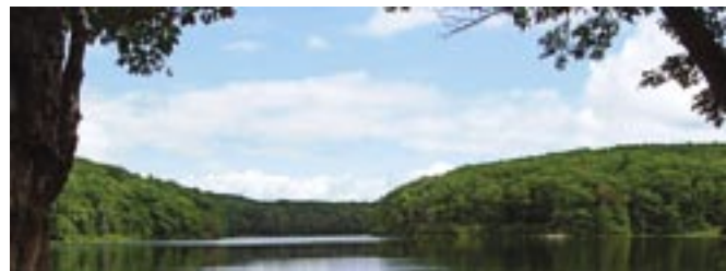
Clockwise from top left: President Obama. Volunteers from Massachusetts went door-to-door in New Hampshire to help get out the vote for the environment. Benedict Pond, Bear Town State Forest.