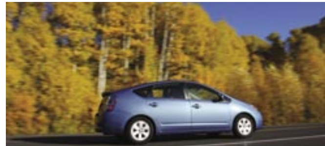
Tougher emissions standards will reduce toxic air pollution from cars and trucks.