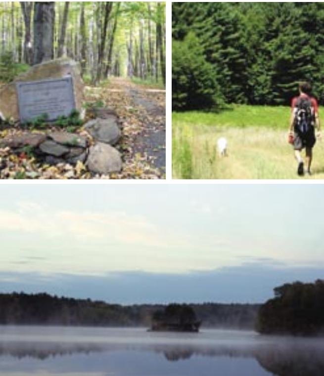
Clockwise from left: John Drummond Kennedy State Park. Mohawk State Forest. Hopkinton State Park.