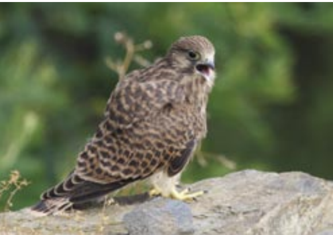
Chemicals from manufacturing can be found in the bodies of the peregrine falcon.