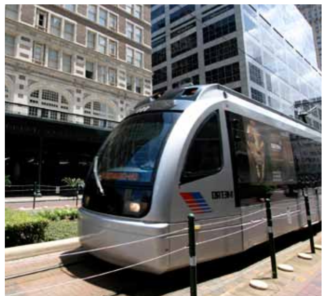
▲ In 2008, light rail had the highest percentage of annual ridership growth among all transit modes—an 8.3 percent increase. (Photo - Houston Light Rail, Ed Schipul.)