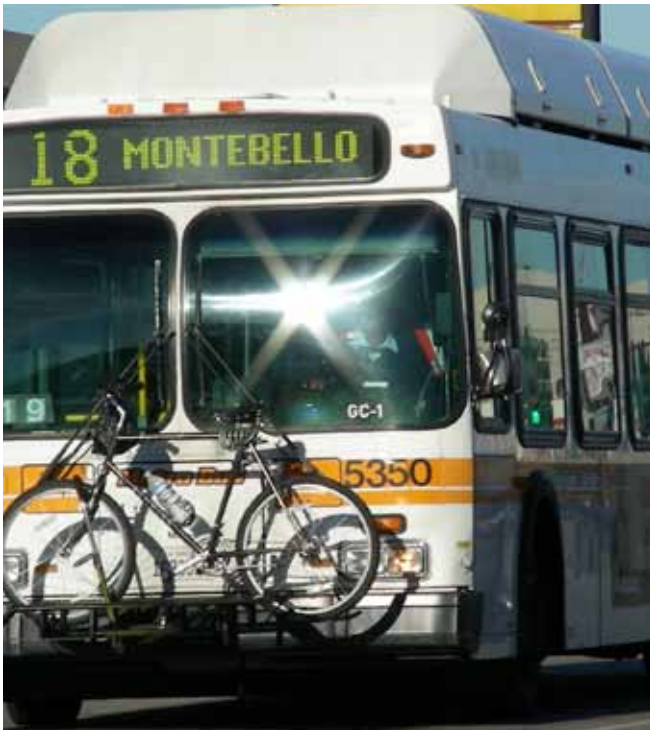
▲ With advances in cleaner fuels, like this bus running in compressed natural gas, public transportation is becoming more efficient and less polluting over time.

is consumed for low-density housing and commercial development;