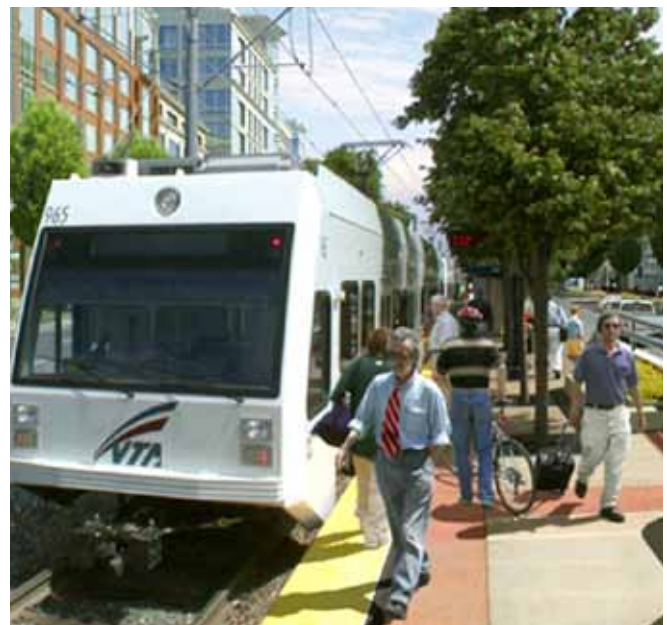
▲ Four in five Americans believe increased investment in public transportation strengthens the economy, saves energy, creates jobs, helps reduce traffic congestion and decreases air pollution.

Existing systems would undergo significant expansion, allowing the largest urban systems to expand heavy rail and grow light rail and bus rapid transit systems linking urban centers and suburban areas. Commuter rail and new high-speed rail