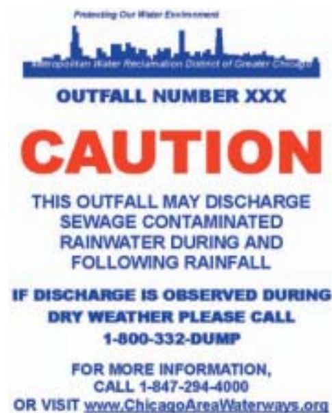
Figure 3: Chicago's new sewage dumping notification signs

website and local phone hotlines and e-mail lists. Additional requirements should include media and health department notification, prenotification, statewide signage and annual statewide and municipal reports.