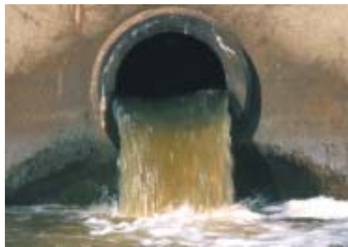
A typical sewage dumping site.

and appears to conflict with federal guidelines. Because of this exemption, it does not appear that most routine dumping events are being reported.