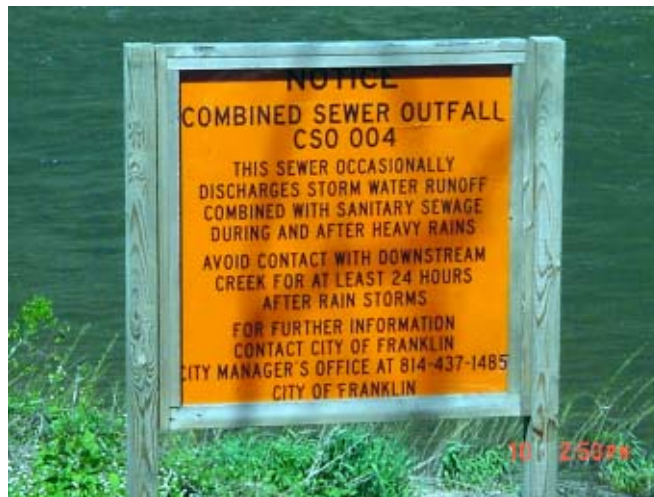
Sewage dumping site in Pennsylvania

methods, as well as prenotification, annual reports from each sewage treatment plant and from the state, and a public education program to teach citizens to avoid the water after dumping occurs. These are the criteria against which state programs are evaluated.