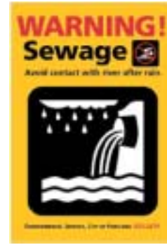
Figure 4. Dumping sign in Portland, Oregon. A model for other cities.

The ideal situation is for all components of this sewage dumping notification plan