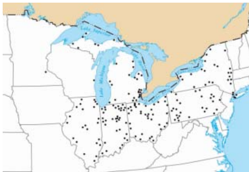
Figure 1. Combined Sewage Overflow (CSO) communities in the Great Lakes states

Yet, over 30 years after passing the Clean Water Act, the U.S. is still dumping over 850 billion gallons per year of untreated sewage into our rivers and lakes. 2 In the Great Lakes, this problem is particularly and increasingly severe. According to a 2002 report by the EPA, if current national trends continue, by 2025 pollution from