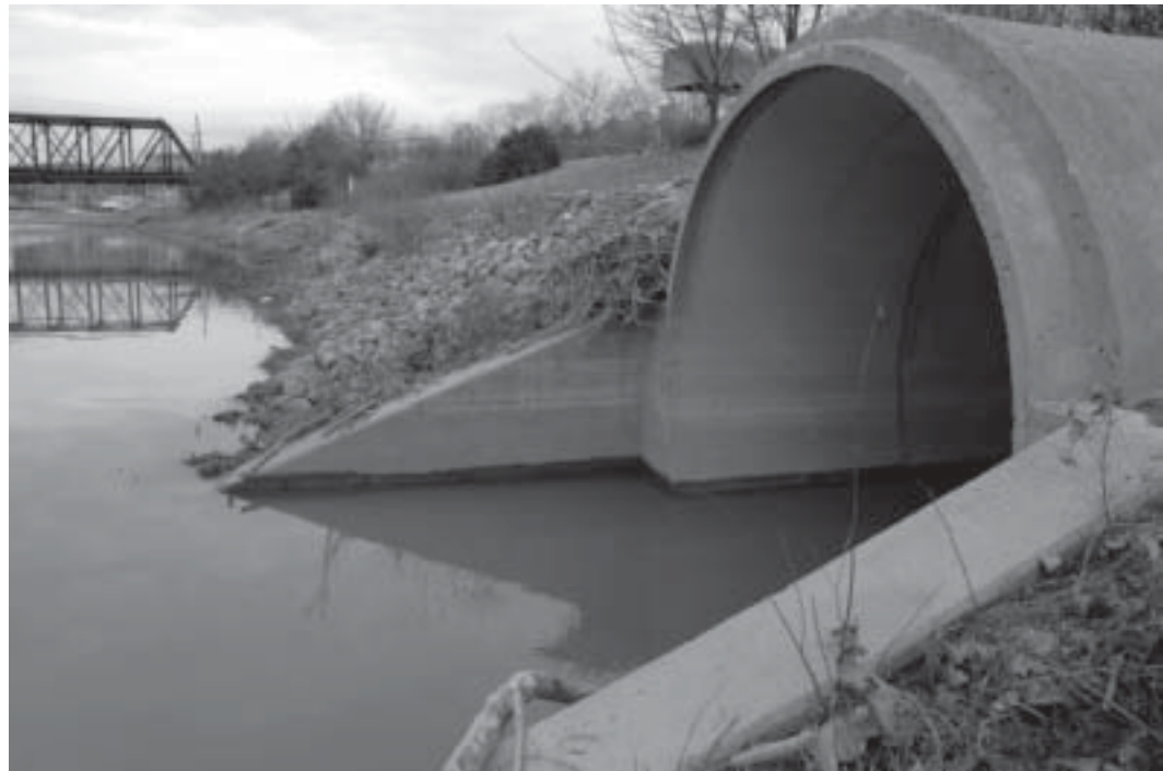
Sewage dumping pipe in Ohio

Recommendation: OEPA needs to fully implement its CSO and SSO strategy, and begin tracking blended releases. Since OEPA has not implemented its own requirements, statewide legislation which requires full, immediate notification (and prenotification) to interested citizens, local communities and the media via e-mail, phone hotlines and a website is needed. This legislation should require wastewater treatment plants to develop public education programs, signage at all overflow sites and a statewide annual report on dumping.