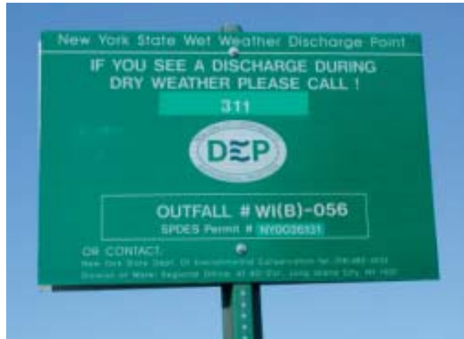
Figure 2: Typical Sign Posted at Dumping Point in New York

Recommendation: New York needs to expand its code and Discharge Notification