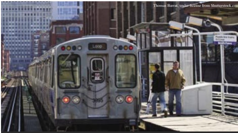
Northeastern Illinois deserves the sort of world-class transportation system that will help the region grow and prosper.

While the bill fixes the 25-year-old formula that led to shortfalls in transit funding, there is more work to be done. The funding only fills the hole in current service and does nothing to meet capital needs. According to the Regional Transportation Authority, $10 billion